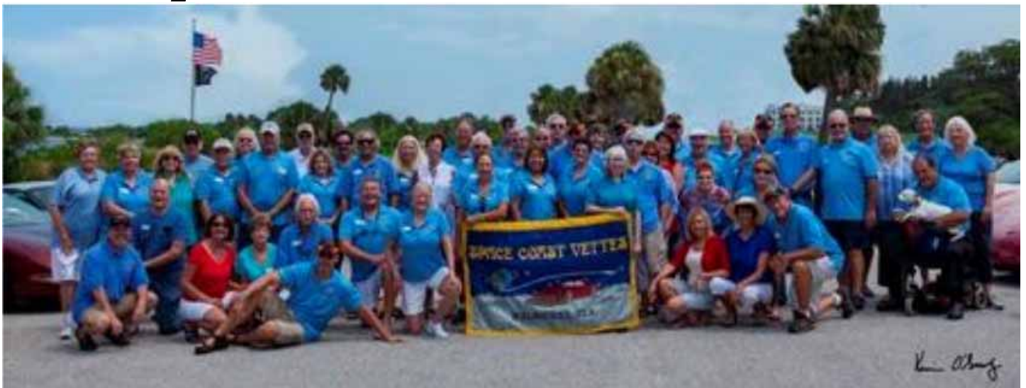
Club Photo July 5, 2015