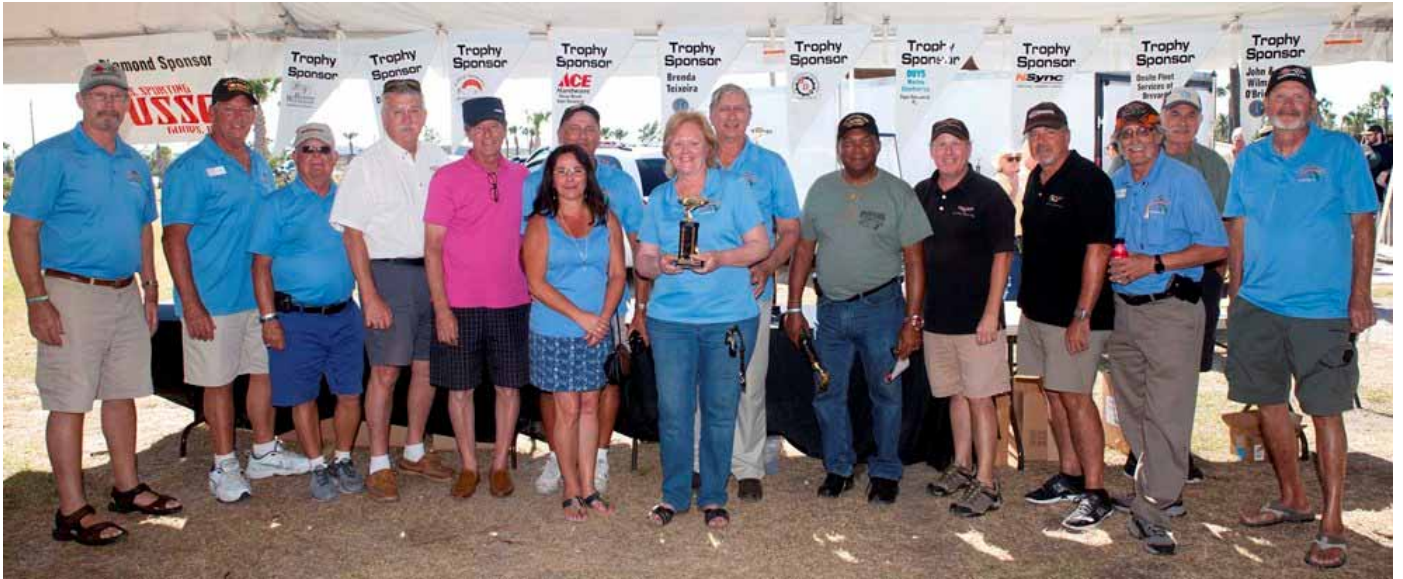
Space Coast Corvette Club won for Club Participation! "Car 181 where are you?" (hahaha!)