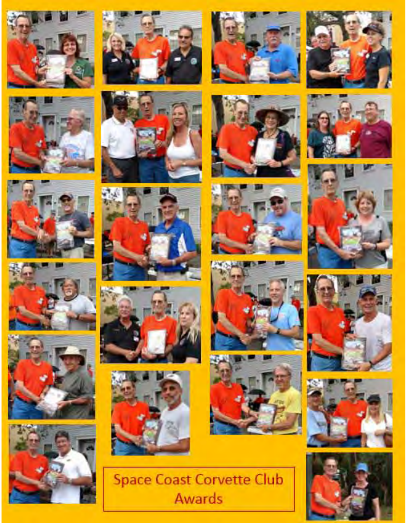
Space Coast Corvette Club Awards