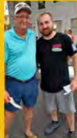
Thank you Eckler's for donating excellent prizes for the drawing!